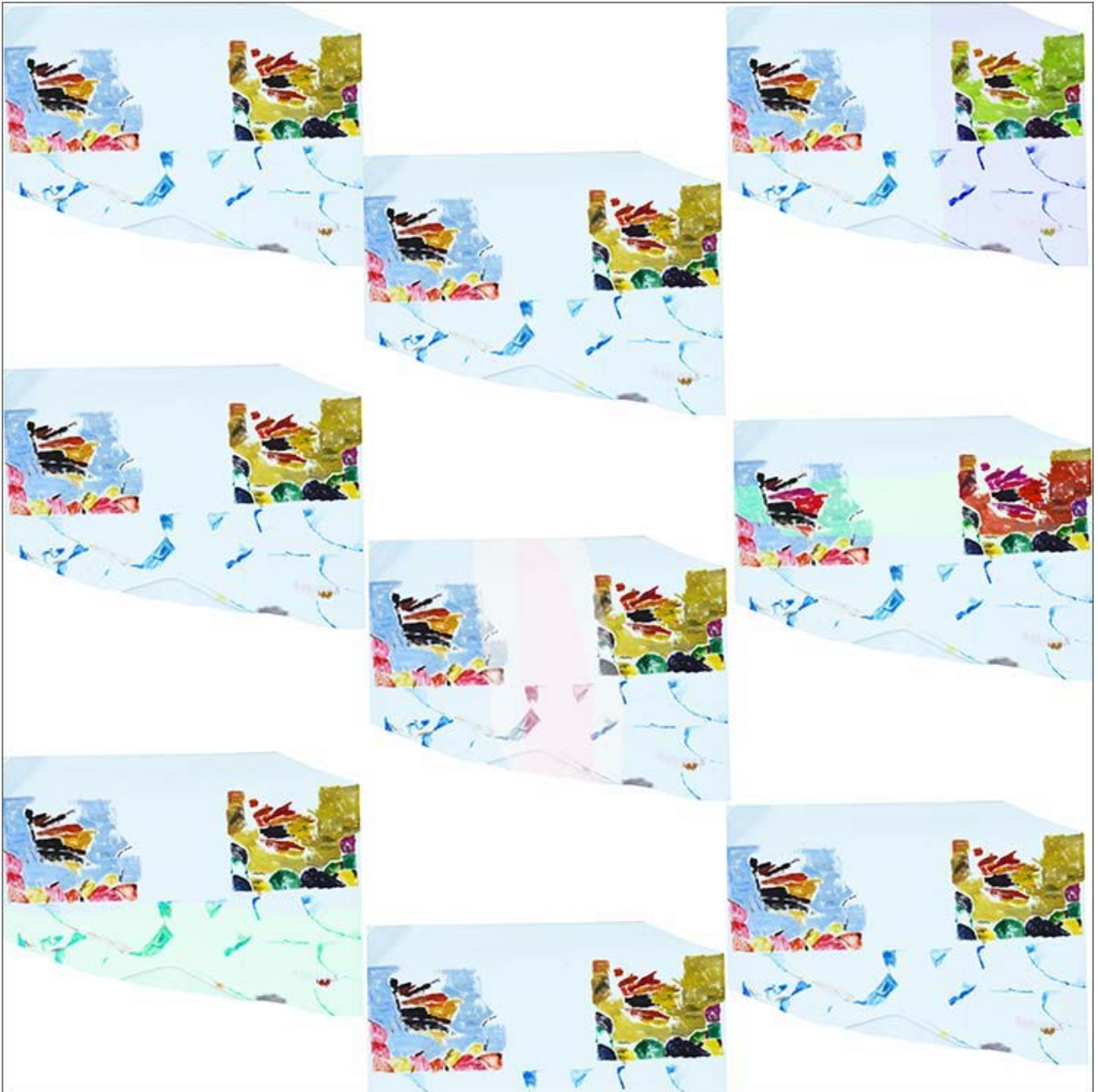
FIG. 4: RE-angels (no. 3), 2017/8 110 x 110 cm

Link to more photos: http://www.janskovgard.dk/wordpress/