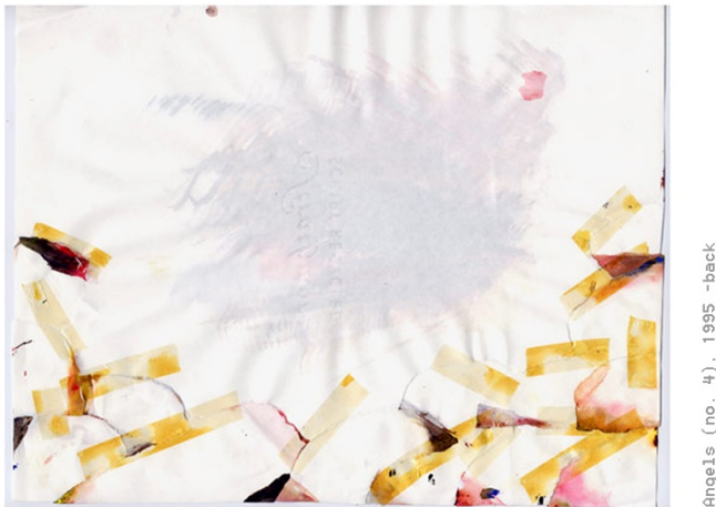
FIG. 1: Angels (No. 4), 1995 - back

I tore small corners of the paper to use them as "brushes". When a watercolor was finished, the paper jams were pasted back onto the paper again.